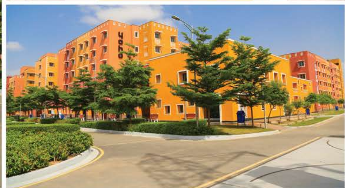
Extension of Manipal University | Jaipur Manipal University Ar. Hafeez Contractor 25,00,000 sq. ft. 150 crores