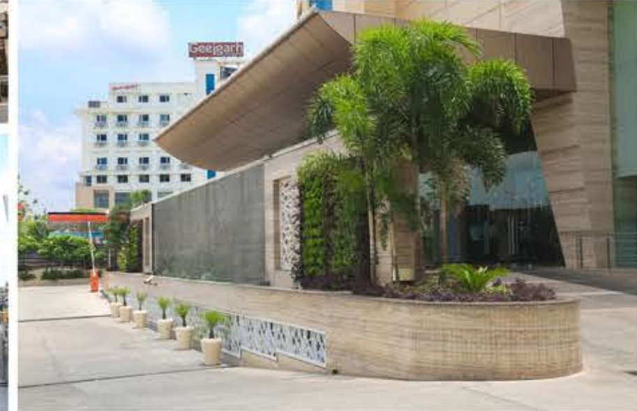
Hilton | Jaipur