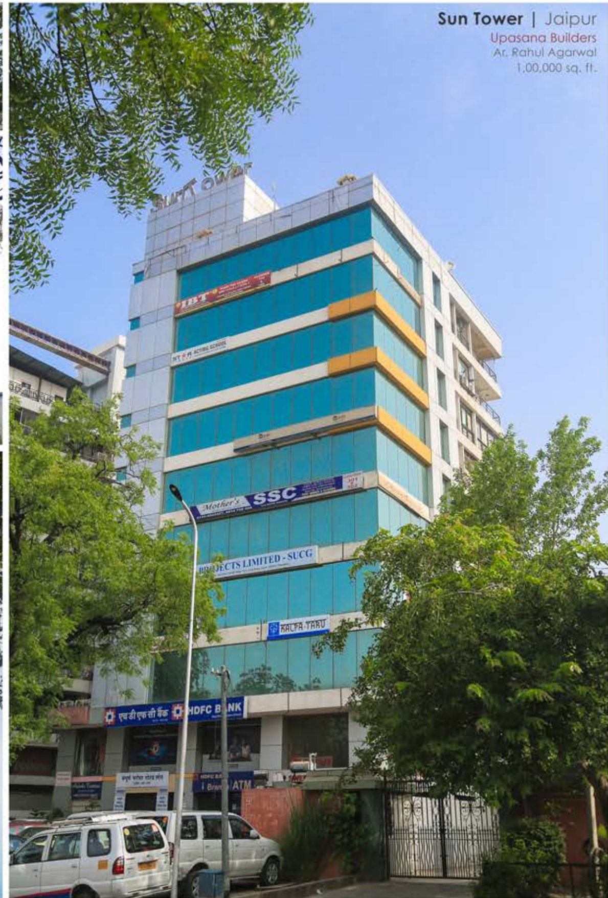
Sun Tower | Jaipur Upasana Builders Ar. Rahul Agarwal 1,00,000 sq. ft.