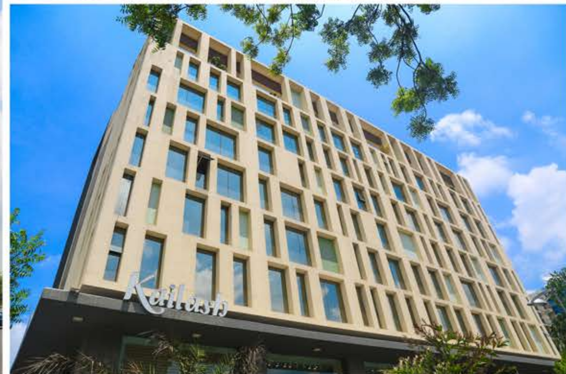
Kailash Retail | Jaipur