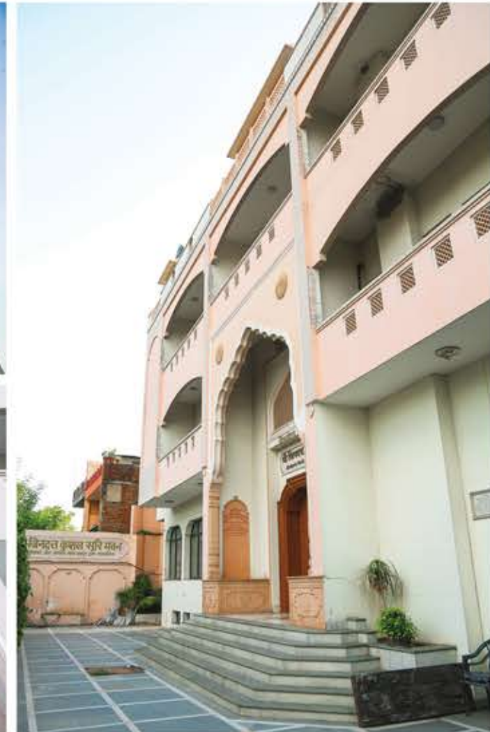
Multipurpose Community Building Shree Shwetamber Jain Shree Mal Seva Bhavan | Jaipur