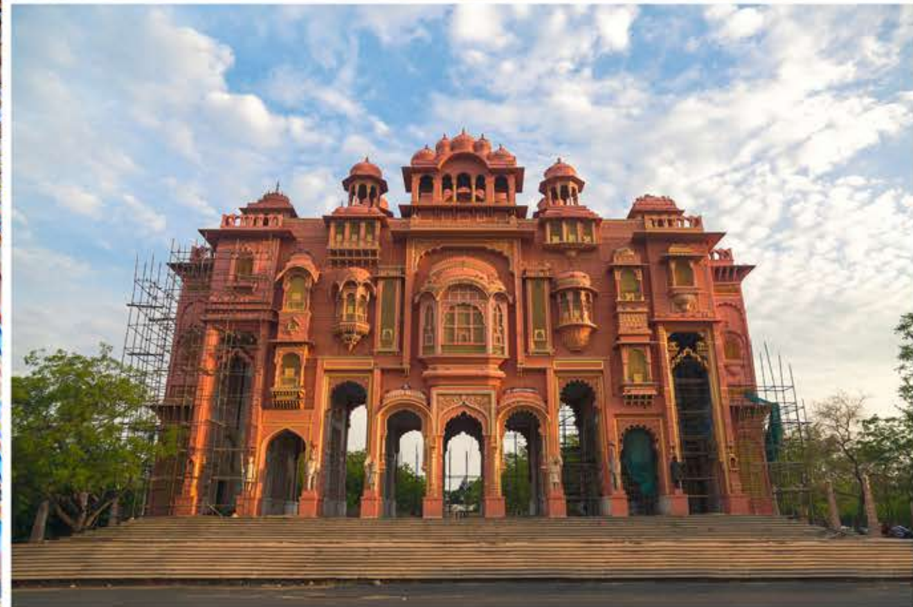
Jawahar Circle Gate | Jaipur