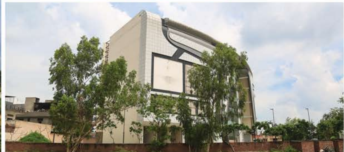
Ashirwaad Mall | Jaipur